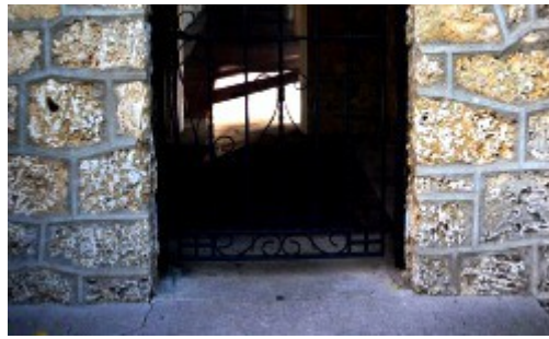
Scary Sunday services?